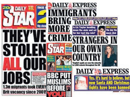
Sensationalist, fear-mongering and untrue.

This training day will equip you to confidently engage with young people on the issues of racism and Islamophobia, enabling them to grow up free from the burdens of prejudice and hate. Young people are confronted with prejudicial influences from a variety of sources. Schools are uniquely placed to counter this by providing young people with knowledge and skills to help them identify, resist & combat racism when they meet it. Young people are developing their value systems; it is during these formative years that discriminatory attitudes be most readily challenged and prevented.